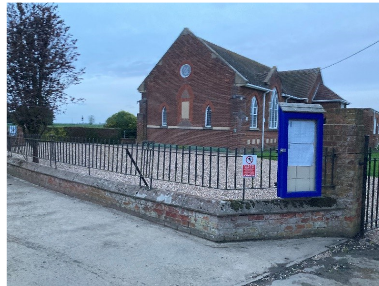
Gosberton Clough Methodist Chapel. See page 10

Covering the villages of: GOSBERTON QUADRING GOSBERTON CLOUGH GOSBERTON RISEGATE